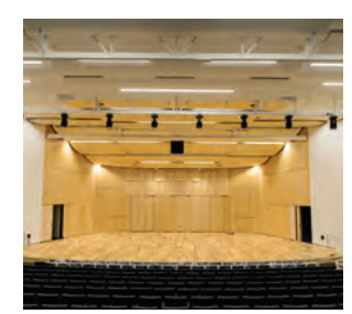
THE SISTER KEVIN MCLAUGHLIN MUSIC HALL Siena Heights University