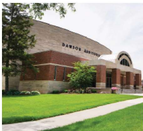
DAWSON AUDITORIUM Adrian College Campus

Visit AdrianSymphony.org for Maps and Directions