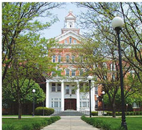
HOLY ROSARY CHAPEL Adrian Dominican Motherhouse